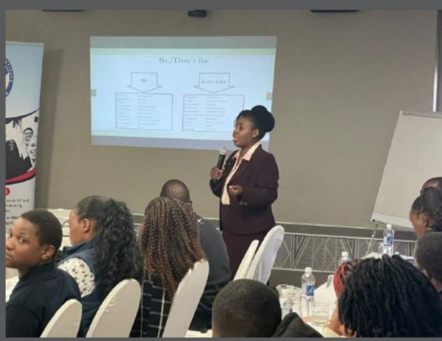
Strategy Formulation Tactics